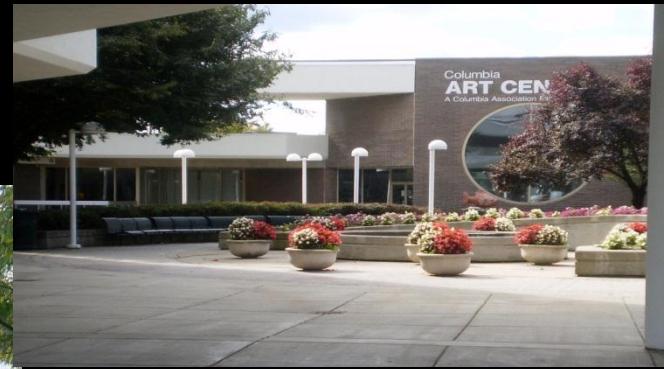
Stonehouse & Art Center